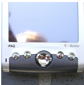
(d) iPAQ h6315