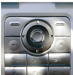
(h) SonyEricsson Z520a