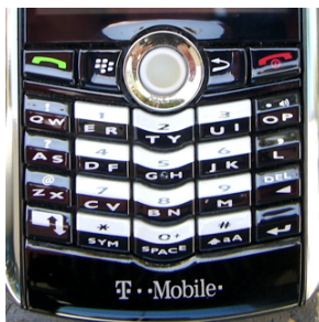
(a) Blackberry PEARL