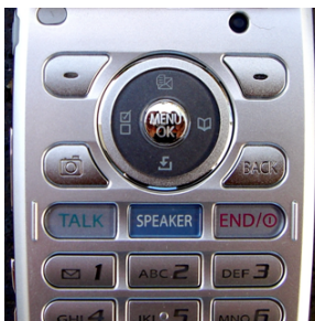
(f) Sanyo MM-8300