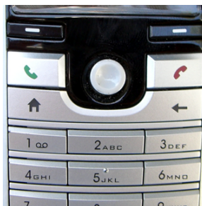
(b) I-Mate SP3i