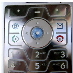
(e) Motorola RAZR