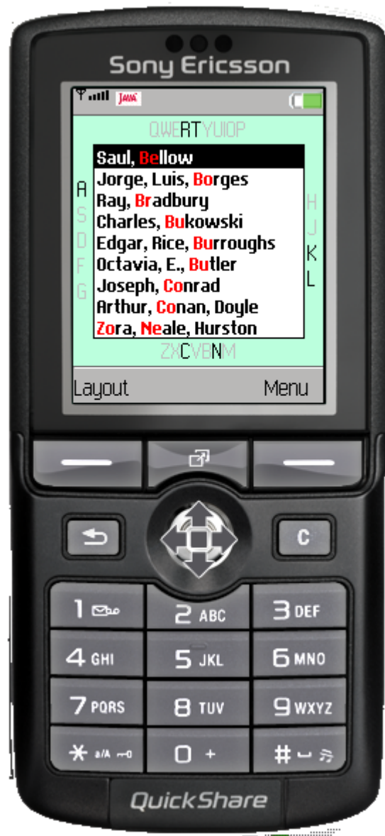
Figure 2: AccelKey running on mobile phone